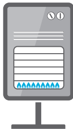
free-standing gas heaters