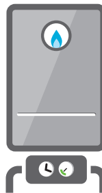
boilers and water heaters